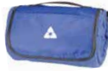
C FLEECE BLANKET SOLD OUT