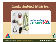
S PHOTO FRAME