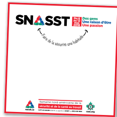
H POSTERS - French