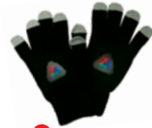
D SMART TOUCH GLOVES