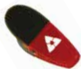
K MAGNETIC CLIP