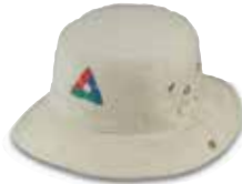
B BUSH HAT