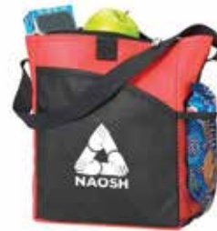
I LUNCH BAG