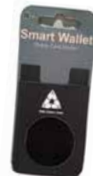
T CELLPHONE WALLET

To order your NAOSH Week products, please complete this form & submit by fax, email or mail