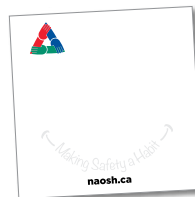
M POST IT NOTES